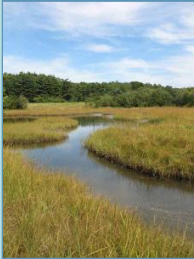
Marsh land along the Bellamy River.