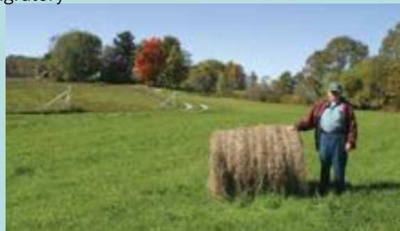
Little Bay Buffalo Farm, Durham, NH.

Partner organizations also collaborate on research projects that further our understanding of the factors affecting the health of land and water resources. Research projects have included studying climate change impacts, invasive species early detection and control, protecting in-stream habitat conditions for aquatic species, identifying migratory fish passage opportunities and addressing control of excessive nutrients.