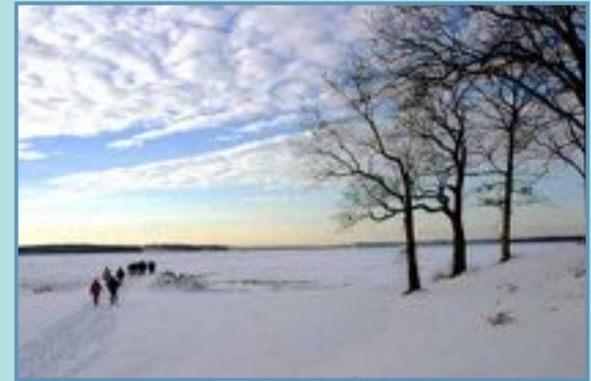
Partners at Great Bay.

* The implementation of the cooperative stewardship model has been demonstrated in the 752-acre Tuttle Swamp Conservation Area and the 2,514-acre Crommet Creek Conservation Area.