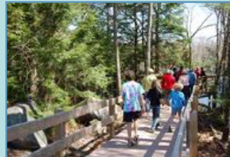
Hiking the board walk on the Sweet Trail.

The coastal region has become an increasingly popular recreation destination area. To meet the needs of both people and nature, the Partnership seeks to provide quality public recreational and educational opportunities that are compatible with natural resource protection and management.