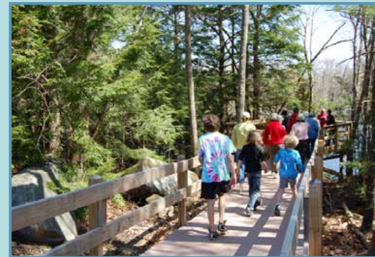
Hiking the board walk on the Sweet Trail.

The coastal region has become an increasingly popular recreation destination area. To meet the needs of both people and nature, the Partnership seeks to provide quality public recreational and educational opportunities that are compatible with natural resource protection and management.