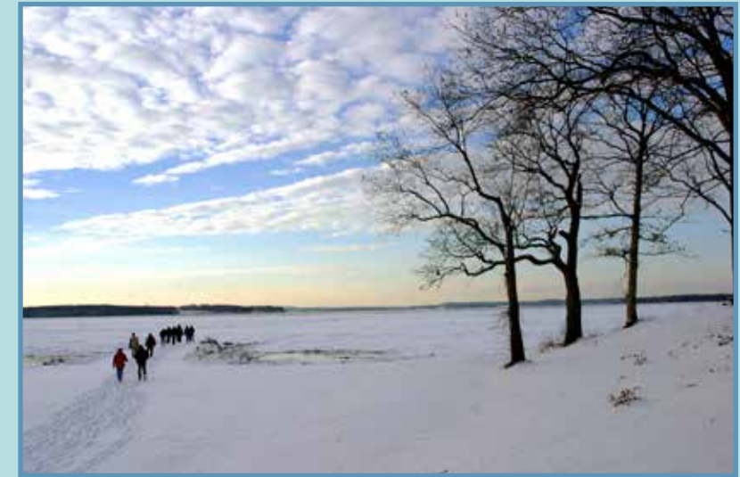
Partners at Great Bay.

* The implementation of the cooperative stewardship model has been demonstrated in the 752-acre Tuttle Swamp Conservation Area and the 2,514-acre Crommet Creek Conservation Area.