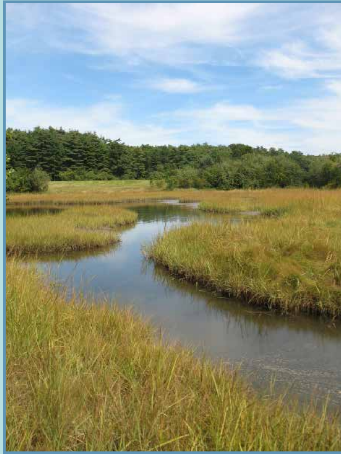
Marsh land along the Bellamy River.