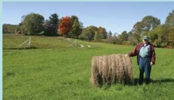
Little Bay Buffalo Farm, Durham, NH.

Partner organizations also collaborate on research projects that further our understanding of the factors affecting the health of land and water resources. Research projects have included studying climate change impacts, invasive species early detection and control, protecting in-stream habitat conditions for aquatic species, identifying migratory fish passage opportunities and addressing control of excessive nutrients.