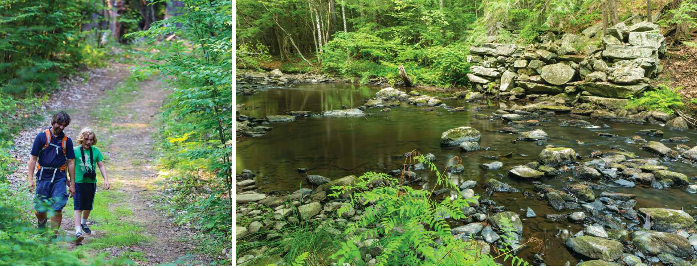
Above: The extensive trail system on the Powder Major's Farm and Forest land offers ready-made recreation opportunities. The trails take you along the Oyster River and past the site of the former Dishwater Mill. These and title page photo by Jerry Monkman/EcoPhotography.

If you walk the meandering trails of the nearly 300 acres of land that are part of the Powder Major's Farm and Forest conservation project, your feet will land on dirt, pine needles, mud, leaves, grass and wildflowers (mind the buttercups!) and maybe even the Oyster River's rocky bottom—if you're prone to wading on a hot summer day.